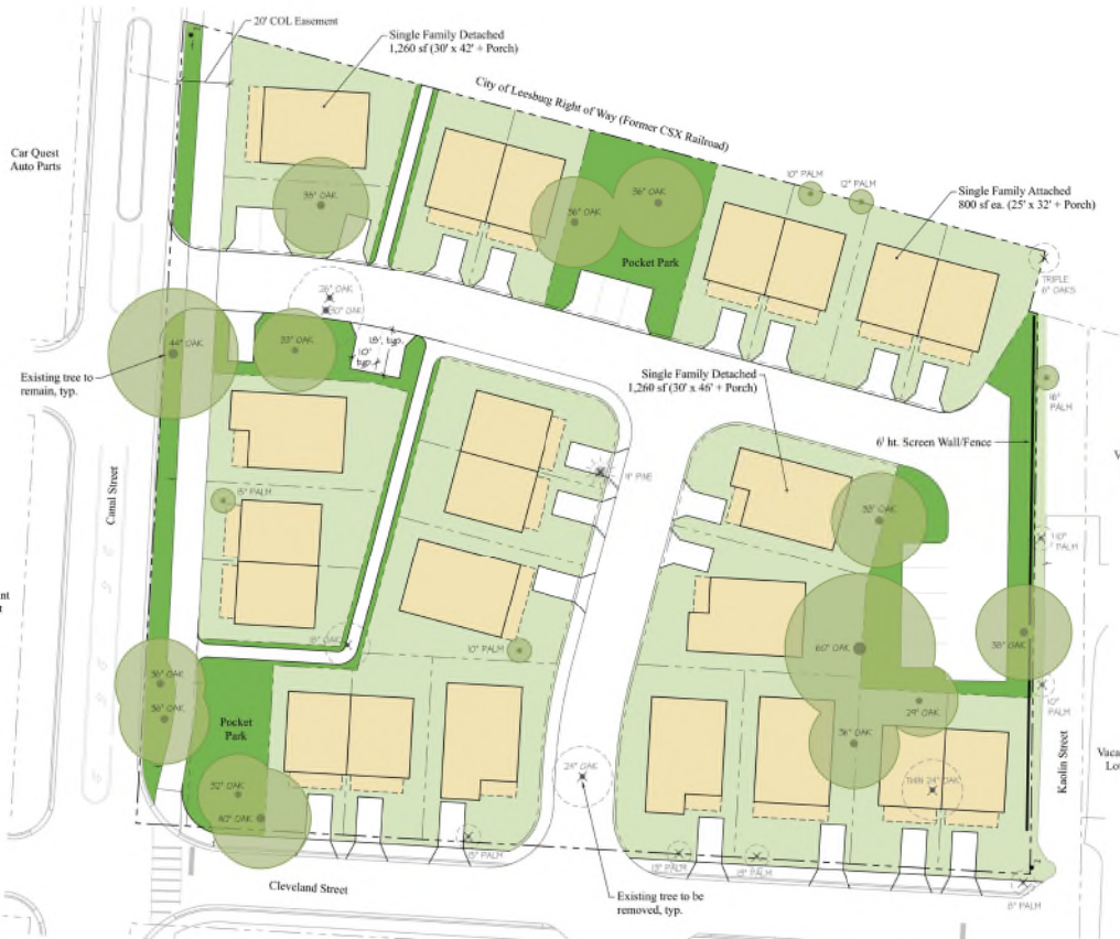
Conceptual Master Plan of the Veterans Village in downtown Leesburg, FL