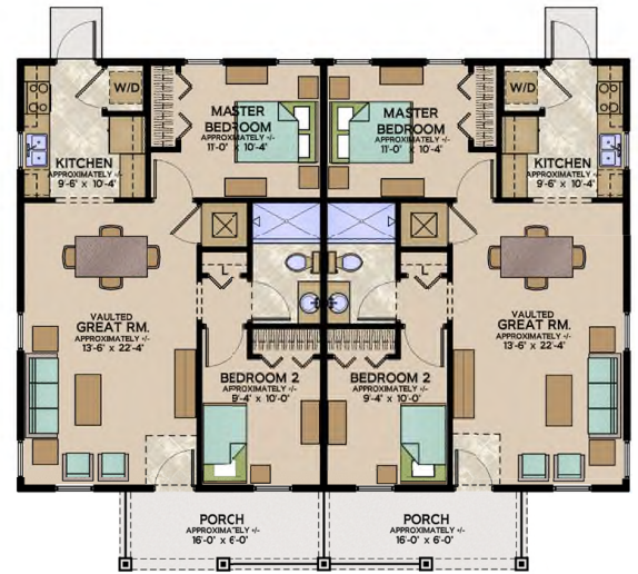
VETERANS VILLAGE PATRIOT 2 BEDROOM / 1 BATHROOM DUPEX